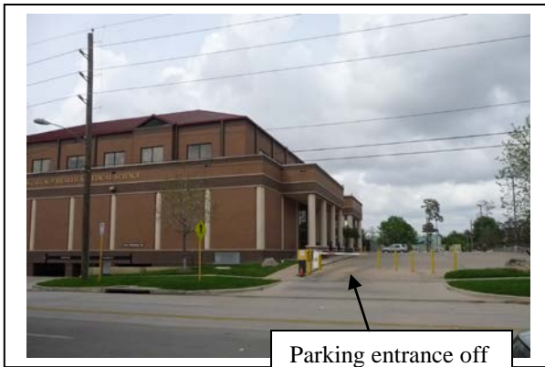
Parking entrance off of Hermann Drive