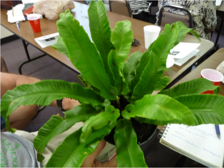
Phyllitis scolopendrium Hart's Tongue Fern