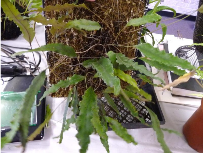
Pyrrhosia lingua Noko Girl